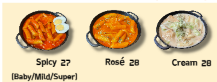
Spicy 27 (Baby/Mild/Super)